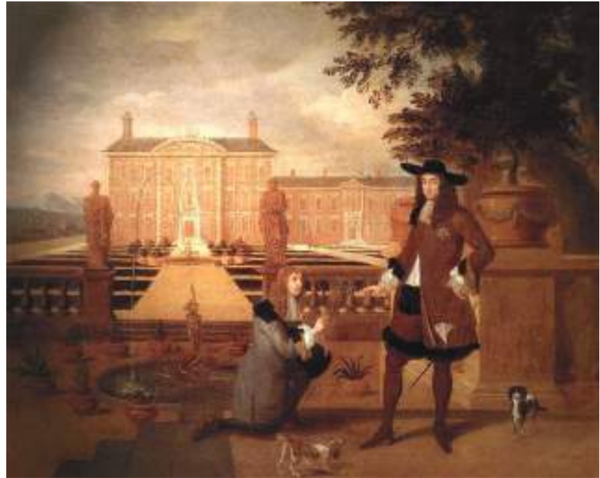
Figure 2. Royal Gardener John Rose and King Charles II. Painting by Hendrick Danckerts, 1675. Image in public domain. (Color figure available online.)

illuminating personal experiences rendered invisible when this content is portrayed as a sterile, decontextualized array of historical or geographic facts.