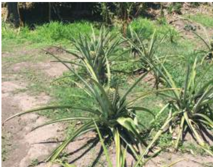
Figure 1. Pineapples growing in central Costa Rica. Photograph by Jerry Mitchell, 2016. (Color figure available online.)

who placed the fruit outside their villages when inviting Spaniards to visit (Coyle 1982), and reportedly, eighteenth-century ship captains placed pineapples on their porches to announce their arrival home after visiting tropical ports. Although this pineapple–hospitality origin story is disputed by some (Theobald 2008), it is now nonetheless enduring. Hidden from view, however, is the fruit’s connection to plantation slavery, which fueled the movement of millions of Africans to the Americas from the mid-1500s to the late 1800s. These people were the intellectual and physical genius behind the cotton industry, which stacked the wealth of Southern enslavers, South Carolina, and the nation.